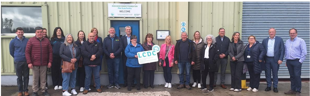
LCDC Members and staff on a site visit to the National Bioeconomy Campus in September